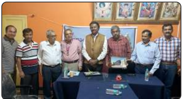
Madhugiri & Koratagere